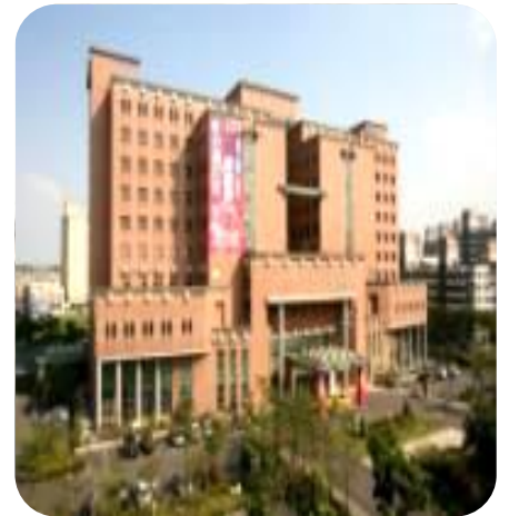
Kaohsiung Municipal Hsiao- Kang Hospital 高雄市立小港醫院