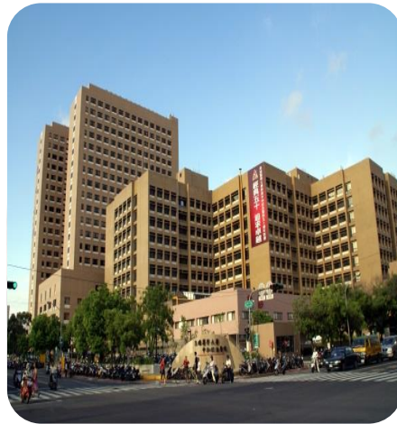
Chung-Ho Memorial Hospital 附設中和紀念醫院