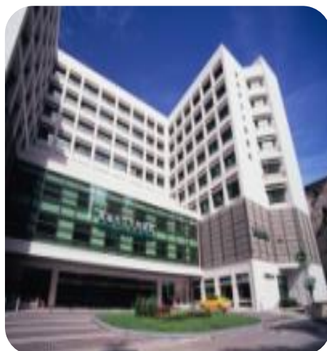
Kaohsiung Municipal Ta- Tung Hospital 高雄市立大同醫院